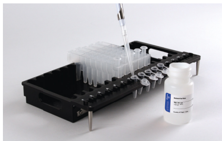
Figure 2. Setup and configuration of the deck tray. Elution Buffer is added to the elution tubes as shown. Plungers are in well #8 of the cartridge.